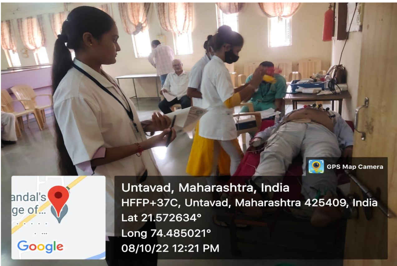
Some Photographs of Free Health Camp (8th October 2022):-